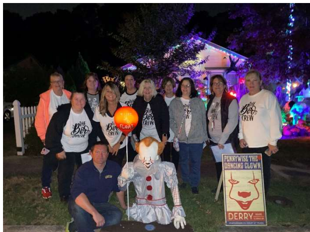
The Boo Crew visited all 26 nominated homes on October 28, 2021