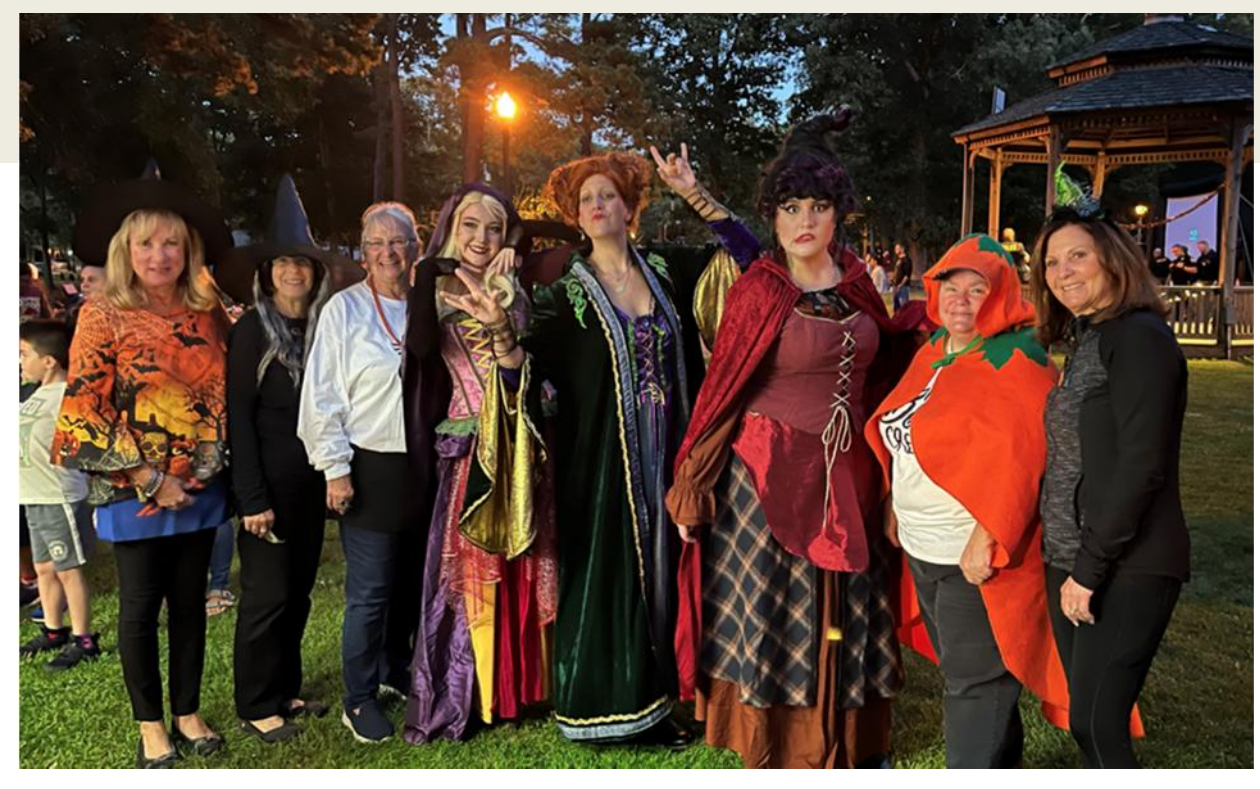
Absecon comes together for our fall Movie in the Park event!

When fully installed and operational, our Smart Energy Network provides a number of benefits, including: • Enhanced reliability with faster and more efficient power restoration • Improved bill management tools and new online features • Better customer experience through upgraded technology improving energy usage reading and billing operations, and nearly eliminating the need for estimated billing. • Better integration of new clean energy technologies, including solar, battery storage, and transportation.